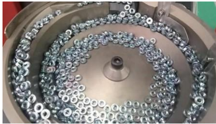
Auto feed system