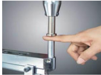
Hand pressing prevent system