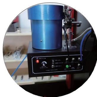
Auto Feeding System (AFS)